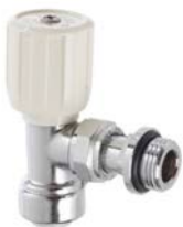
367PF WH wheelhandle radiator valve angle pattern