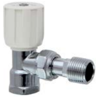
369 WH angle pattern wheelhandle radiator valve for iron