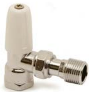
369 LS lockshield radiator valve angle pattern for iron