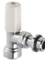
367PF LS lockshield radiator valve angle pattern