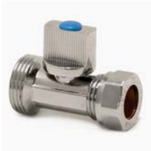
K637 appliance valve, straight pattern