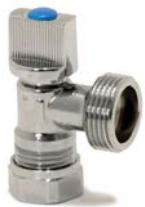
K638 appliance valve, angle pattern. Available in chrome plate finish as standard