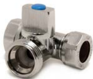
K639 appliance valve, tee pattern. Available in chrome plate finish as standard